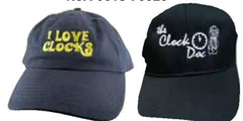
No. 75001 No. 75002